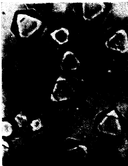
Fig. 1. Urease crystals.

It seemed to me of interest to employ dilute acetone instead of 30 per cent alcohol and to see whether this substitution would result in any improvement in the method of purification. Accordingly I diluted 316 ml of pure acetone to 1000 ml and used this as the means of extracting the urease. I